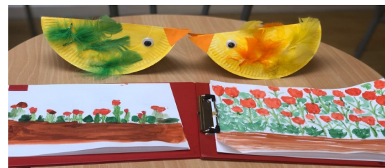
Easter artwork from the childcare group, and paintings of the tulips in the Rosary Garden

Our childcare setting is run in partnership with our cluster of primary schools. We have been delighted to welcome pupils and staff from St. Joseph's Clydach and St. Joseph's Cathedral School to Bishop Vaughan and we work closely with St. Illtyd's and St. David's who have remained in their current settings to ensure that, between us, we can cater for families throughout the city.