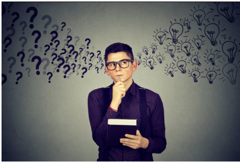
How to choose the right subject or course