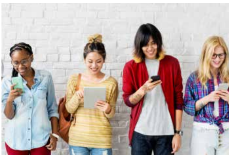
Options at 16